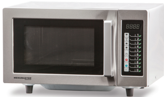
Model MMS10TS shown